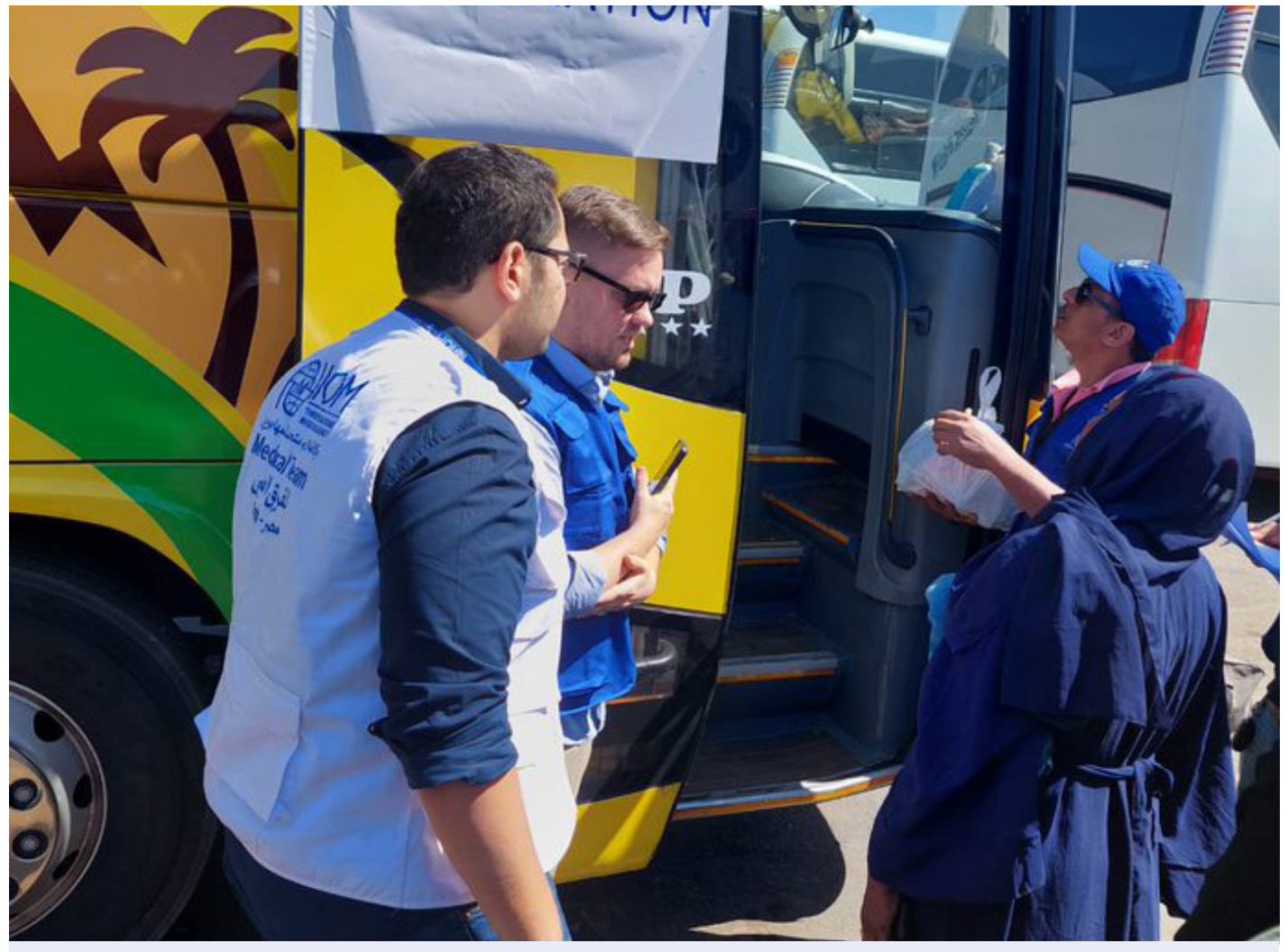
IOM Egypt supported 56 Cameroonians to safely return home.

men below 16 and above 50, as well as females of any age, are allowed visa-free entry (after completing a set of formalities). The wait for men who need visas spans days: it takes 6-8 days to cross the border for men who are required to obtain visa and 1-2 days for those who are not. There are reports of persons stranded in "no man's land (between Sudan and Egypt)" facing dire conditions, without access to food, WASH, or shaded areas. On the Sudanese side, the Sudanese Red Crescent is reported to be operational, however, with significant shortages in supplies. IOM has so far provided 50 wheelchairs, 750 hygiene kits, 750 dignity kits, 750 food boxes, and 30 first aid kits through ERC. The Organization also provided return assistance to 56 Cameroon nationals (including a pregnant woman and 12 children), in addition to food, accommodation, medical and transportation support.