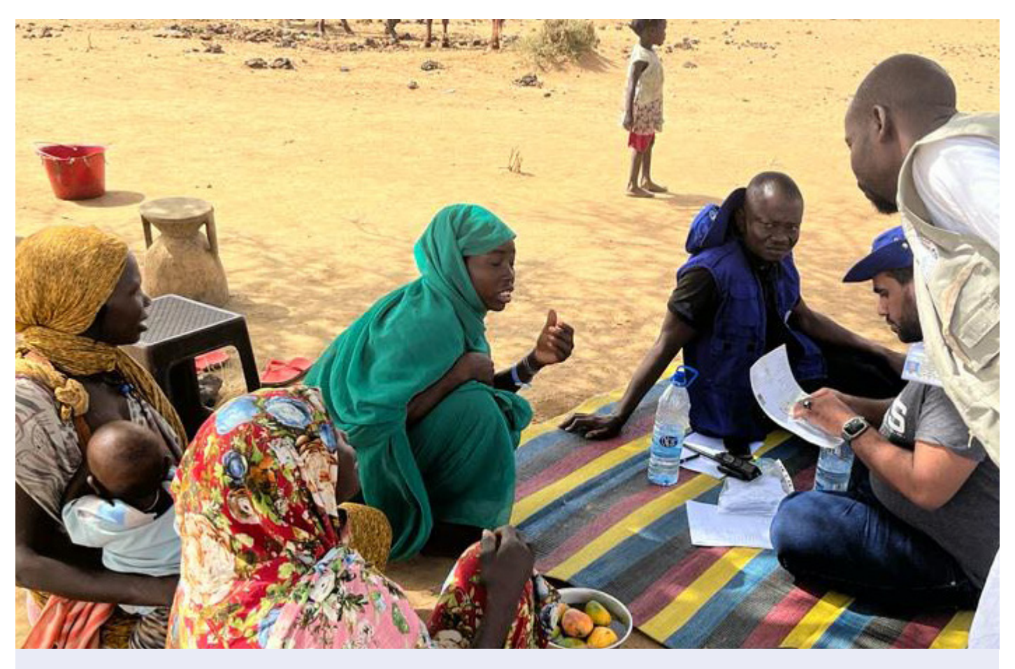
A joint team from IOM and the Government of Chad conduct an interview with a family displaced by the violence in Sudan.

IOM continues to register Chadian returnees in eight returnee sites along the border, in coordination with the government and partners. As of 8 May 2023, approximately 15,000 returnees have arrived in eastern Chad; 6,690 returnees have already been registered by IOM. IOM is also preparing to provide water to 6,000 people through water trucking, as well as the first round of direct assistance and voluntary return for returnees. Resources are urgently needed to scale up the response to the increased mixed population flows, particularly ahead of the rainy season, which could hinder access.