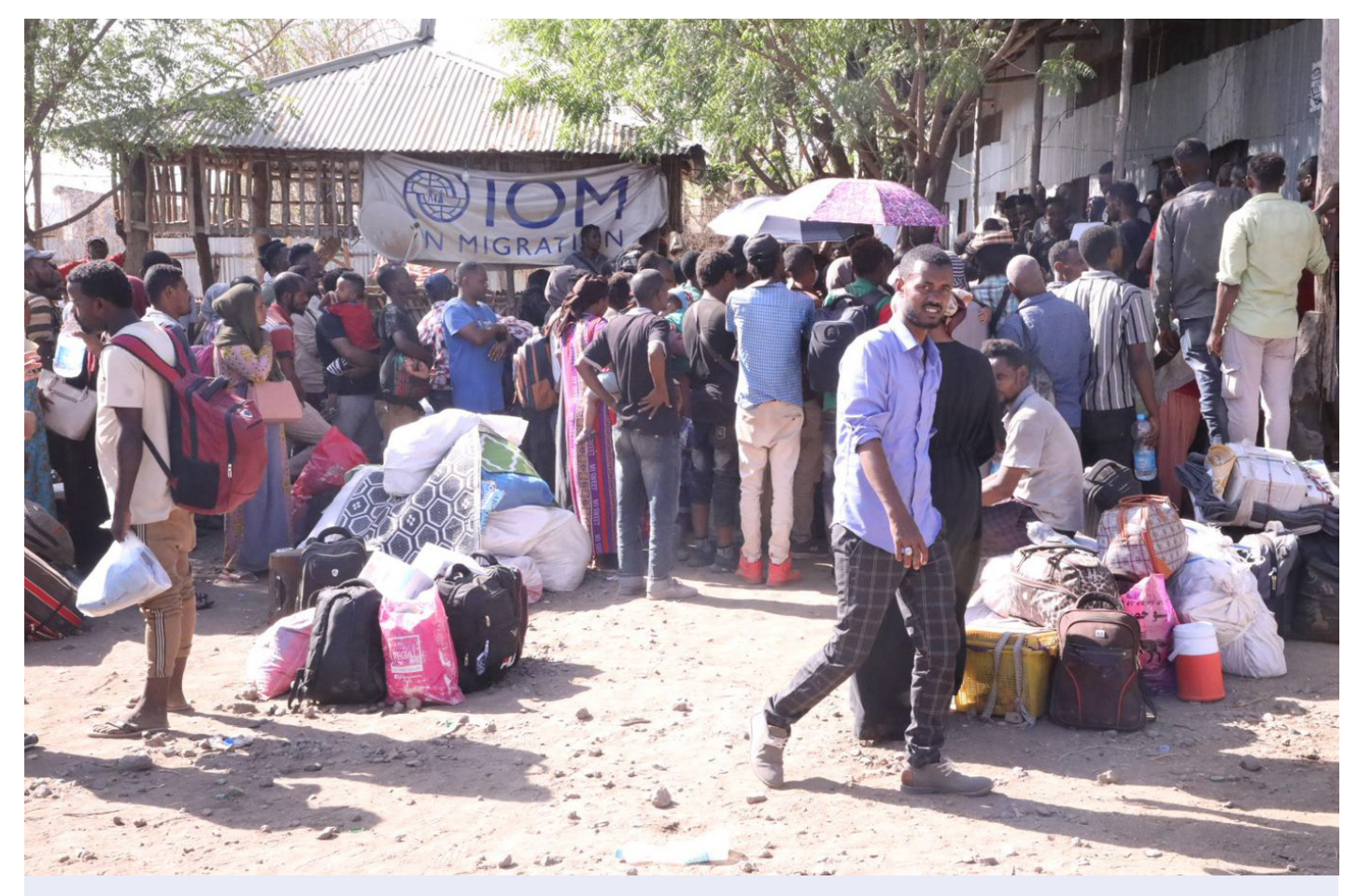
IOM is providing assistance to vulnerable returning migrants at the MRC

IOM has scaled up its presence at the border point in Metema and is providing multi-sectoral assistance to Ethiopian returnees and TCNs, including immediate health and WASH assistance, onward transportation and tailored protection assistance. In collaboration with the Ethiopian Public Health Institute and Emergency Medical Team from the Federal Ministry of Health, IOM is providing medical assistance, referrals and mental health and psychosocial support at the Metema border point. IOM has also improved the reception area by providing shades, hand washing facilities, latrines, and showers. IOM is providing tailored assistance to vulnerable migrants at its Migrant Response Center and provided transportation assistance to more than 6,700 Ethiopians to return to their home communities and transportation assistance to over 1,200 TCNs to Addis Ababa, including 297 supported with assisted voluntary return to their home countries.