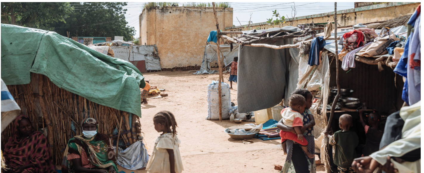
Photo taken in 2021 of a displacement site in Sudan. The unfolding crisis is deepening humanitarian needs across the country

Though information on movements towards CAR is limited at this time, partner estimates put expected arrivals as high as 10,000 arrivals in the coming weeks. An estimated 500 arrivals were reported on the evening of 24 April, with verification activities ongoing. IOM is working together with UNHCR and partners on contingency planning for the potential influx, including on establishing reception facilities, prepositioning critical supplies, and support for vulnerable caseloads. The response is challenged by security and access concerns.