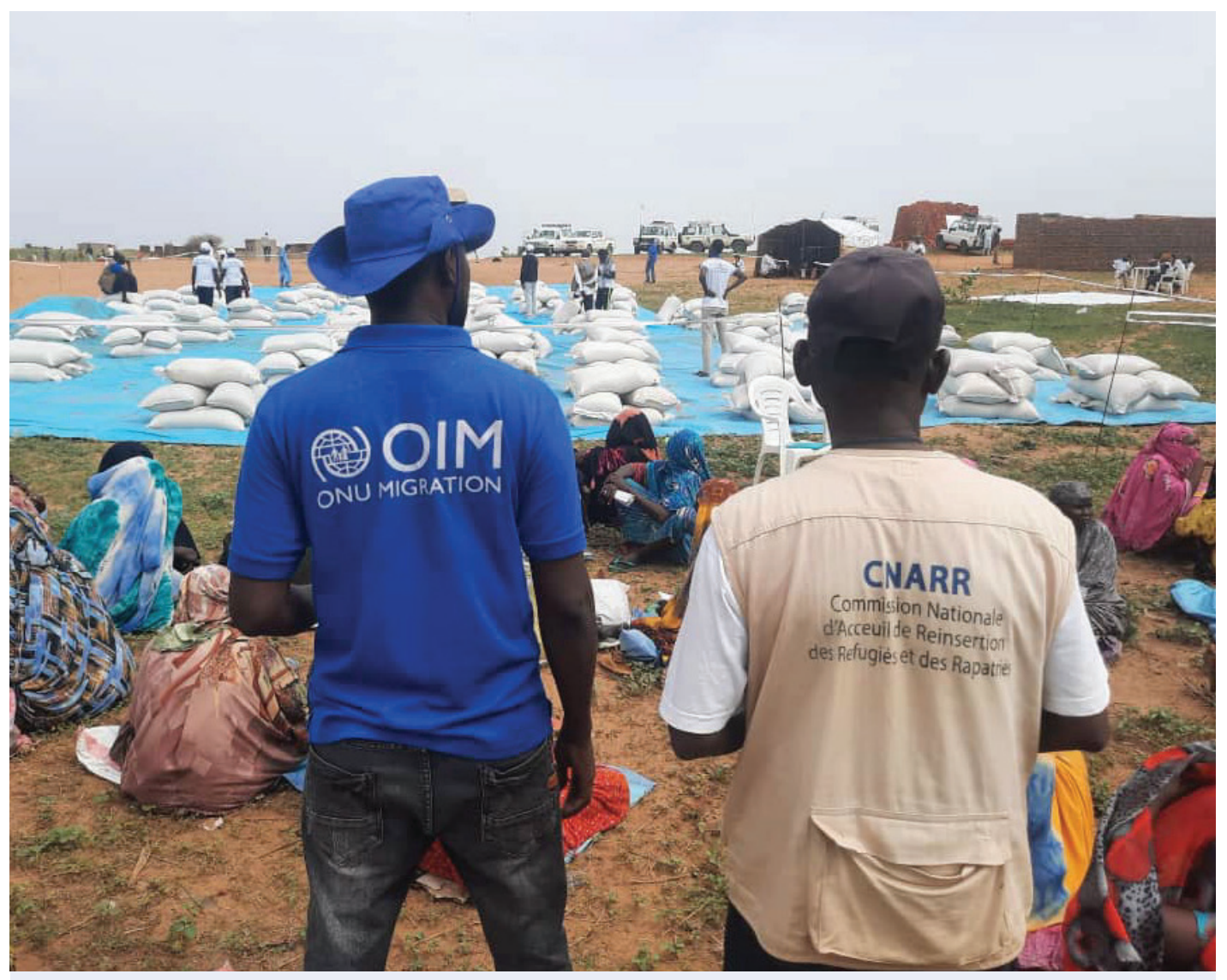
IOM supporting WFP food distributions for over 16,000 returnees in the east of Chad

As part of its CCCM activities, IOM is constructing 10 communal shelters and an information desk in Rotriak, Unity state, and 2 additional communal shelters in the Bulukat transit centre. IOM is also strengthening information sharing mechanisms in the transit centre to ensure that appropriate information is shared with returnees upon arrival and while at the centre.