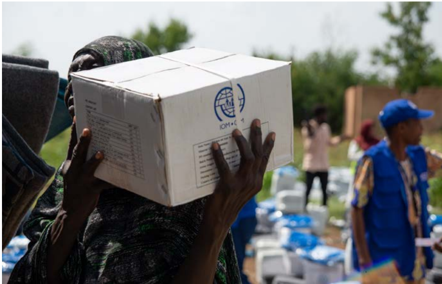
Distribution of lifesaving non-food items to displaced families in Gedaref.