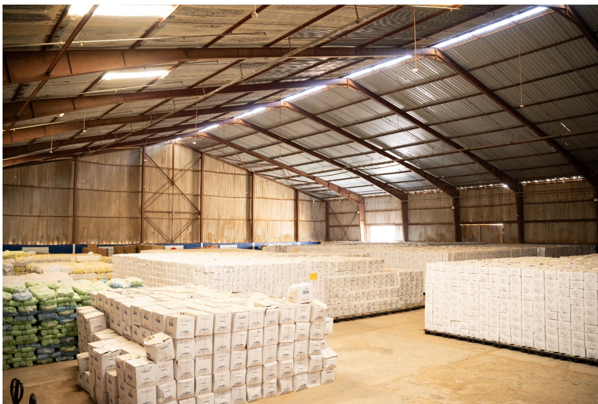
Shipment of NFI (Non-Food Items) kits has arrived in Port Sudan, Sudan. The kits, which include essential items such as blankets, cooking utensils, and hygiene supplies, will be distributed to humanitarian partners across the country to help meet the needs of those affected by the ongoing conflict.

The deteriorating situation in Sudan also has dramatic implications on neighbouring countries, many of which are grappling with their own protracted crises. Sudan shares borders with seven countries, spanning three regions, and is an important migration country at the intersection between countries in East and Horn of Africa and Libya and Egypt, along the Central Mediterranean route, as well as for migrants heading towards the Gulf, via the Northern route. Since the outbreak of the crisis, over 1.4 million people have been reported fleeing Sudan into neighbouring countries – namely Chad (39.2%), South Sudan (27.6%) and Egypt (24.5%). Approximately 65% of arrivals tracked in those countries were Sudanese nationals and 35% were returnees and third country nationals (TCNs).