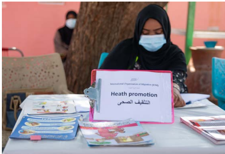
IOM Mobile Clinic is providing primary health services to crisis-affected communities in Gedaref.

The RRF provides a streamlined and flexible grant application and disbursement process to finance the localized and life-saving emergency response. Through the RRF, IOM and its partners have so far reached 308,450 people in Sudan through ES, NFI, WASH, Health, Nutrition, FSL, CBI, MHPSS and Protection interventions.