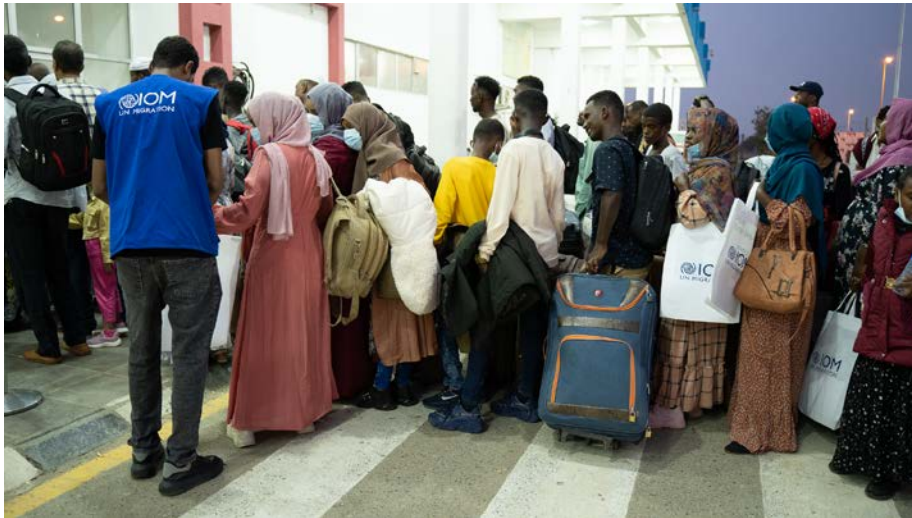
Resettlement movement of refugees to Canada from Port Sudan.