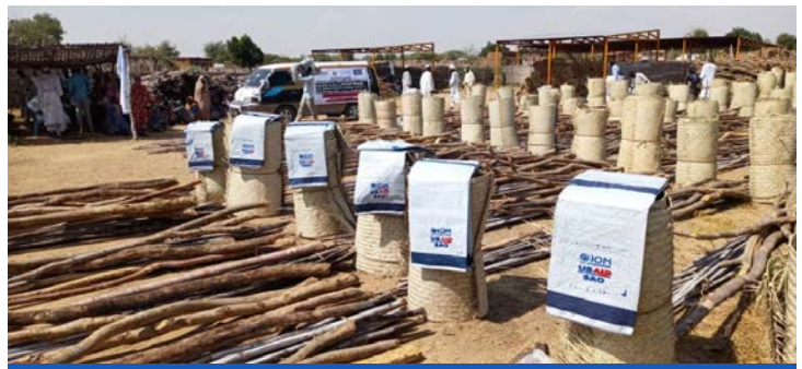
Distribution of 3,500 emergency shelter kits in Nyala camps, South Darfur.

The RRF provides a streamlined and flexible grant application and disbursement process to finance the localized and life-saving emergency response. Through the RRF, IOM and its partners have so far reached 308,450 people in Sudan through ES, NFI, WASH, Health, Nutrition, FSL, CBI, MHPSS and Protection interventions.