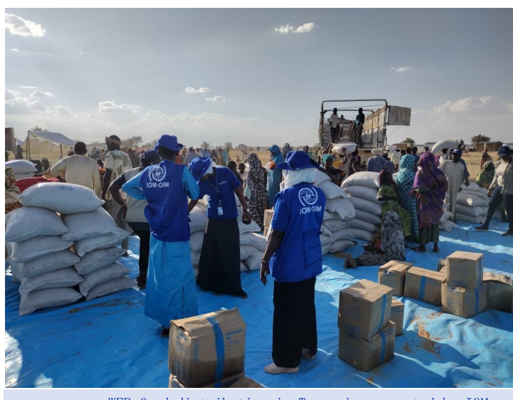
WFP food distribution in Tongori, supported by IOM.

During the reporting period, IOM continued to provide health, WASH, protection, and MHPSS assistance as part of its multisectoral response to populations affected by the crisis. IOM continues to regularly test water quality to ensure safe drinking water for affected populations, and over the reporting period, delivered 85 m3 of potable, clean water to the Metema PoE.