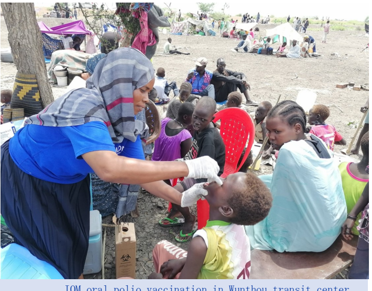
IOM oral polio vaccination in Wunthou transit center.

The deteriorating situation in Sudan also has dramatic implications on neighbouring countries, many of which are grappling with their own protracted crises and strained resources. Since the outbreak of the crisis, 1,373,223 million people (an estimated increase of 10,233 individuals from last report) have been reported fleeing Sudan into neighbouring