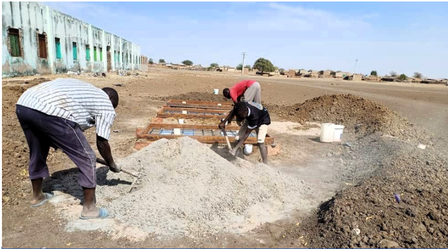
Latrines construction underway in Sennar state to improve basic hygiene and sanitation across the state.