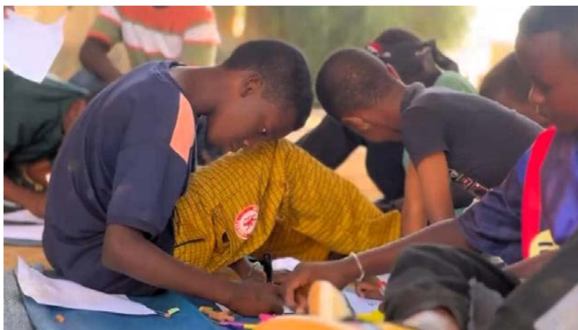
Mental health and psychosocial support activities at Al Slam IDP gathering site in Kassala state.

The worsening situation in Sudan has also significant impacts for neighboring countries, many of which are already dealing with prolonged crises. Sudan shares borders with seven countries across three regions and plays an important role in migration, serving as a crossroads between countries in East and the Horn of Africa, Libya, and Egypt, particularly along the Central Mediterranean route. It serves as a passage for migrants heading towards the Gulf through the Northern route. Since the outbreak of the crisis, 1,884,909 million people have fled into neighboring countries , with Chad (37%), South Sudan (31%), and Egypt (25%). Cross-border movements are rapidly increasing, particularly towards South Sudan, Ethiopia and Chad, putting pressure on already limited capacities to provide humanitarian assistance to conflict-affected populations.