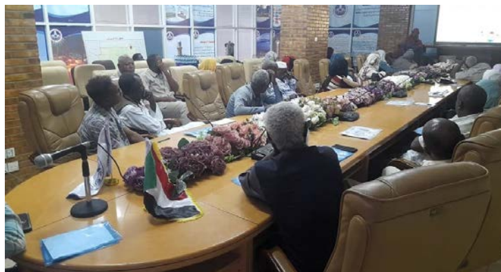
Emergency response training for health workers in Port Sudan.

To increase the ability of crisis-affected communities to meet their basic needs in a way that is most suited to their preferences, IOM has provided cash assistance to 49,230 individuals in Sudan. IOM also provides grants to community-based organizations (CBOs) as seed funding for livelihoods and other life-sustaining activities.