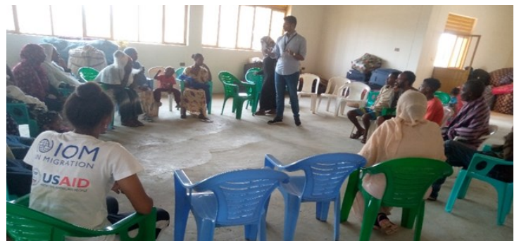
Awareness creation on mental health and upper respiratory tract infection for Ethiopian Returnees, June 2024