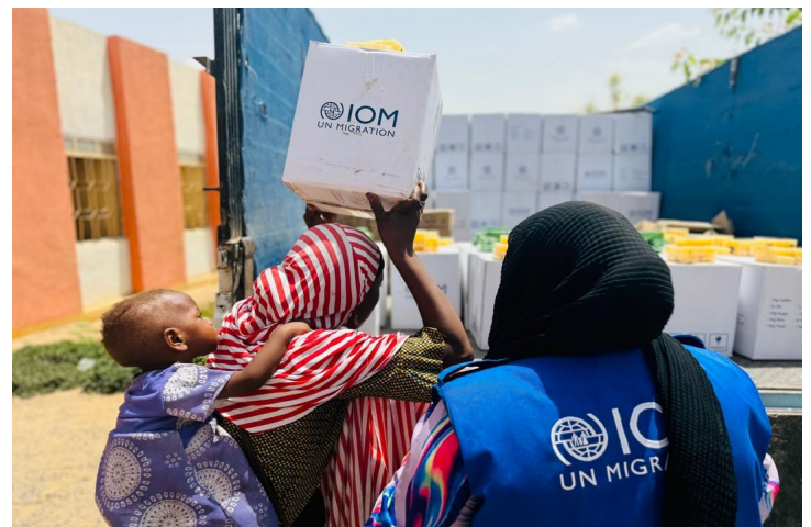
Food distribution to displaced families and migrants in Kassala, June 2024