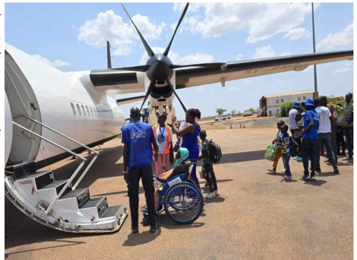
OTA in Malakal, May 2024

People continue to cross into South Sudan as well, which has seen the arrival of over 700,000 individuals to date, the majority of whom are South Sudanese nationals returning home. 420,000 returnees are expected to arrive in South Sudan by the end of 2024, of which 150,000 will need onward transportation assistance (OTA). Given the priority of the United Nations in South Sudan to avoid the creation of new camps for displaced people due to limited resources, IOM's OTA operations remain a critical piece of the response in South Sudan to the Sudan crisis